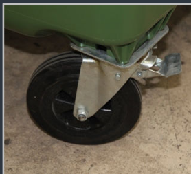
Solid tyre & foot brake