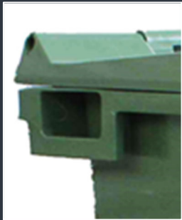
Robust Moulded Handle