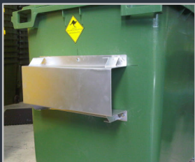
Custom made steel pocket Also Available