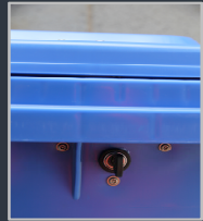
Uniquely coded Lock barrel, mounted under comb lift area.