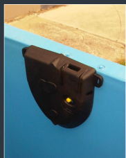
Uses Lock Focus Internally Mounted Lock Housing.