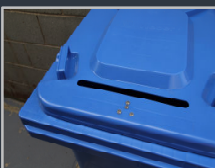
Smooth Die Cut Document Slot